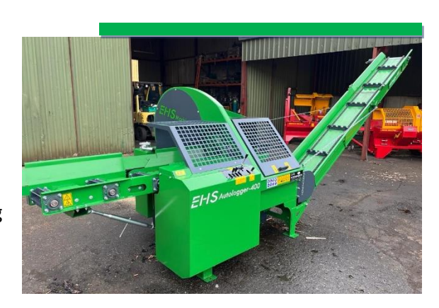
Available in PTO or Three Phase 4 Models Available

It features a huge 400mm cutting capacity and an extremely strong 18 ton splitting ram.