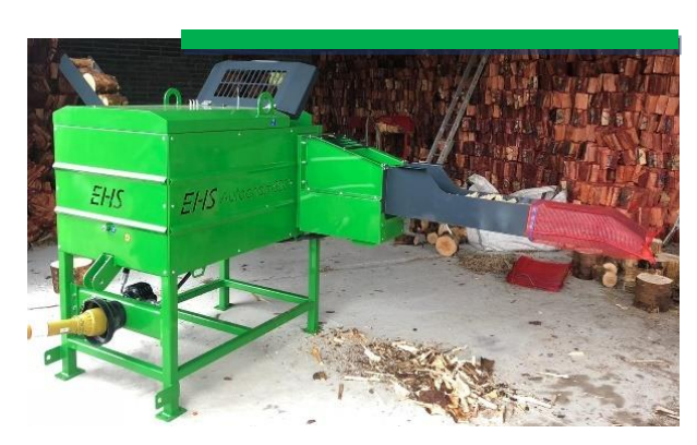
Available in Electric & PTO 2 Models Available

Can be easily stopped, started and loaded by one operator. Can produce thin kindling chunks or firewood. The long bagging chute provides a simple means of packing the kindling and logs for storage, sale or transportation.